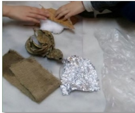
Figure 4. Children select materials and objects to cocoon the ice-cube

The findings revealed that the children were able, to some extent, to approach the insulating or non-insulating property of the materials. This is evident from the fact that most of the children (4/6) selected aluminium foil as the most suitable for maintaining the “frozen snowball”. Respectively, most of the children (5/6) considered the fabric inappropriate as a material for the preservation of the “frozen snowball”. Each child developed their reasoning to justify his/her choice, whether it was about snowball management or the choice of material or object. Paper was not selected as an appropriate material from most of the children (5/6). Regarding the choice of paper as a suitable material, only one child chose it without giving a justification.