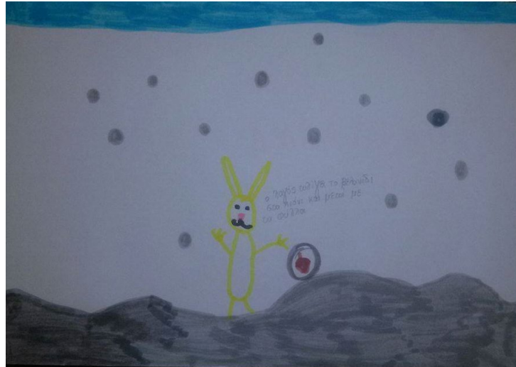
Figure 3. Drawing the rabbit cocooning an acorn with snow and leaves