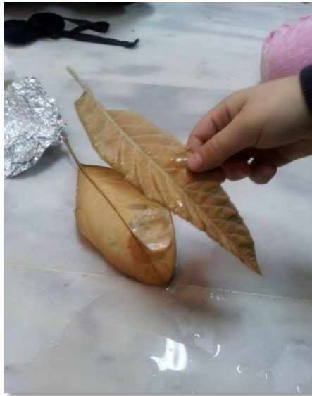
Figure 1. Cocooning the ice-cube with leaves

The findings revealed that children unfold and expressed their ideas about the phenomenon as being in the character of the rabbit or the hedgehog while handling and experimenting with the materials and objects during their dramatic play (Figure 1).